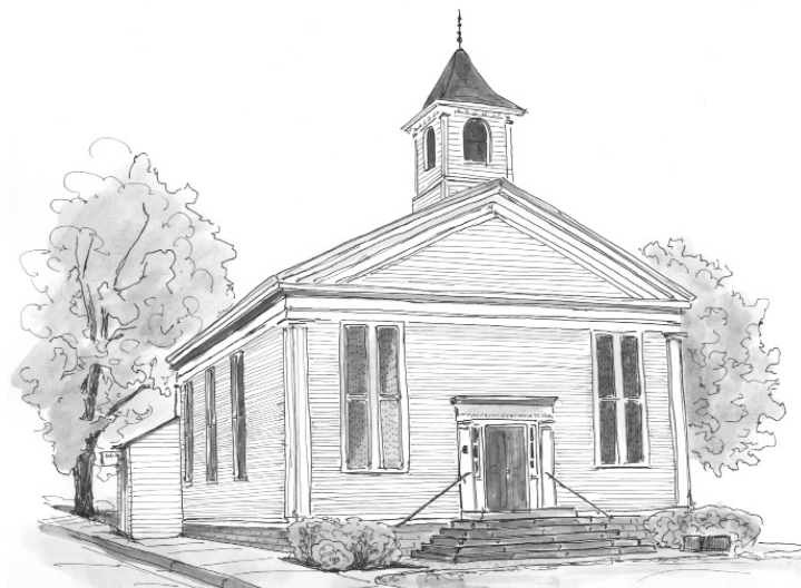
The Little White School Museum