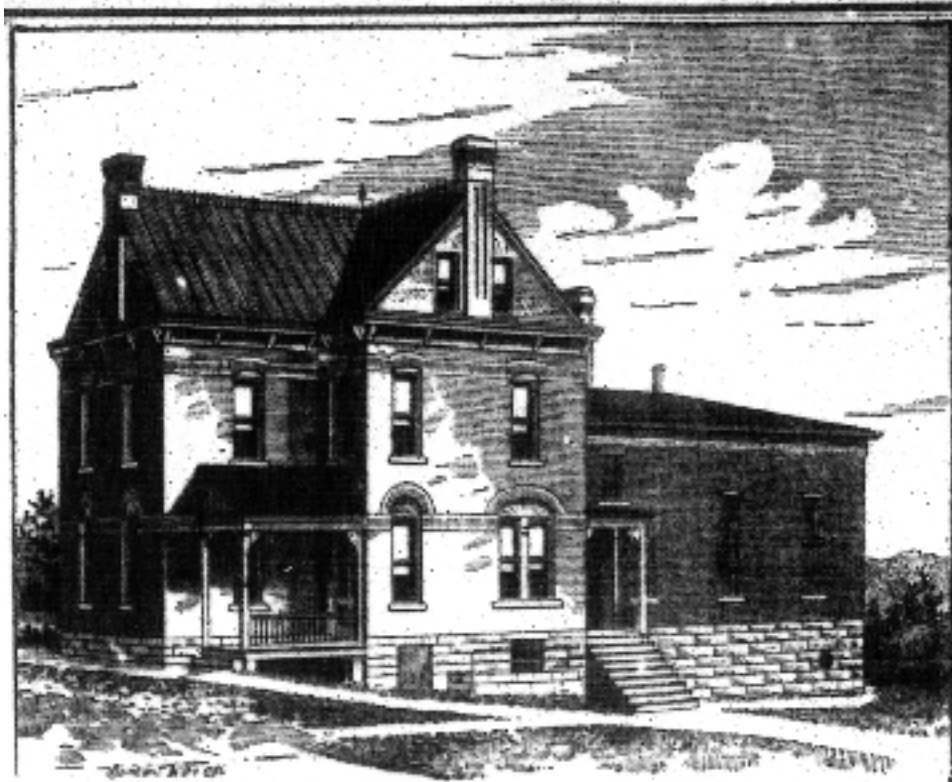
THE NEW JAIL AND SHERIFF'S RESIDENCE.